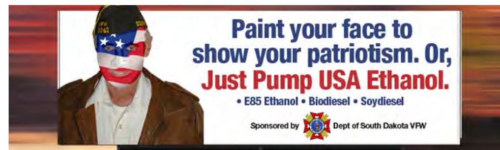
These billboards need to be placed in high traffic areas to create the dialogue about America's dependence on foreign oil and the alternatives. That takes media dollars.

TAKE DOWN THE PICASSO AND HANG UP THE NEW ART OF PATRIOTISM. These posters are brilliant because they are not only colorful and witty, they make a desperately needed wake-up statement. They are worth collecting and hanging up. Nothing less than an ornate gold frame will do.