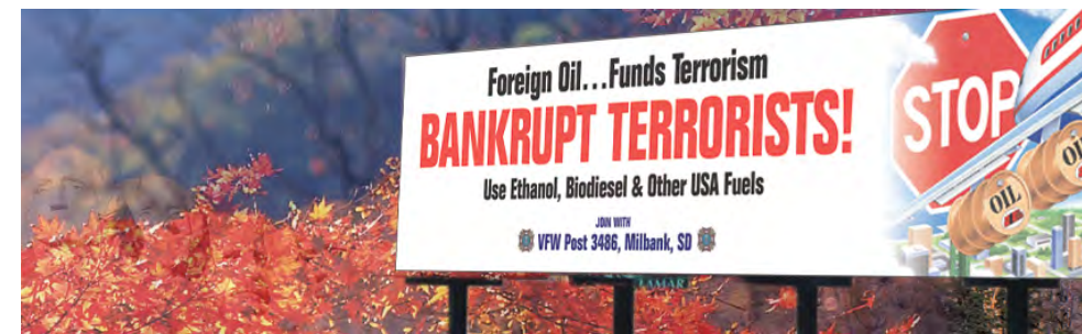
Summit, South Dakota — The site of the first FOIL billboards sponsored by the Dept. of South Dakota VFW. Posted September 25, 2002.