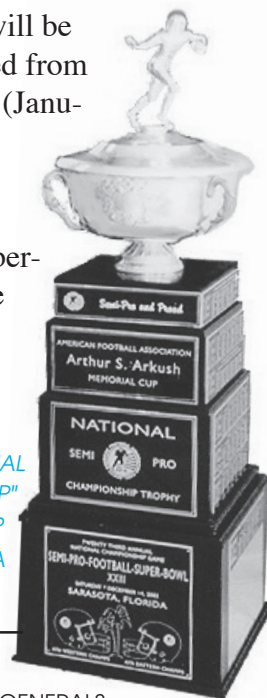
25th ANNUAL "ARKUSH MEMORIAL CUP" NATIONAL CHAMPIONSHIP DECEMBER 11, 2004 • SARASOTA, FLORIDA