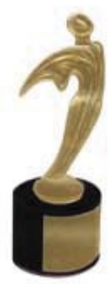
2003 TELLY AWARD Songs and Score