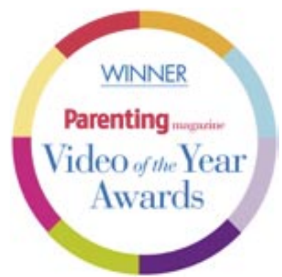
PARENTING MAGAZINE'S Video of the Year

Our 'pilot', in it's rough form alone has achieved an amazing amount of interest, feedback, commendations, press, festival attention and even limited distribution.