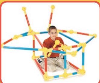
Super Jet Fighter