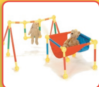
Swing Set & Cradle