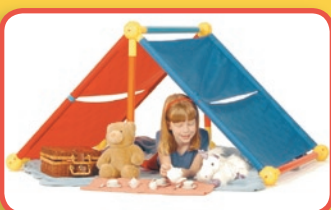
Tea Time with Friends