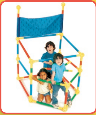
Ship & Crew