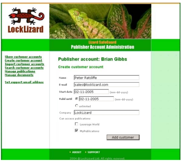
Diagram 2: Web Administration System