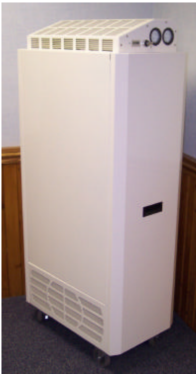
AeroMed ? 700P portable unit

The AeroMed ? 700P is also available with a germicidal UV section for additional protection from airborne pathogens. The AeroMed ? 700P is an excellent choice for any area where controlling airborne pathogens may be a concern, such as waiting areas, isolation rooms and procedure rooms.