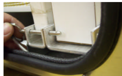
Door seal on 700P

Sealed Operation. The doors and filters in the 700P are properly sealed to prevent air bypass. This helps ensure that all air is treated by being passed through the filters prior to recirculation back to the room.