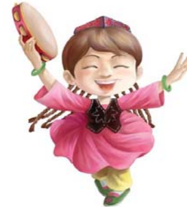
Girl of Uyghur tribe