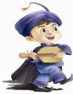
Boy of Yi tribe