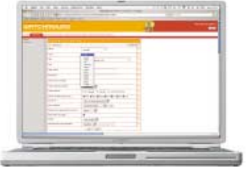
Setting up your monitoring configuration is flexible and easy.