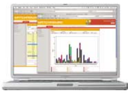
View the performance of your server in different types of graphs.

We guarantee our customers 100% uptime. To fulfill this guarantee, we use several monitoring systems. Based on experience we can say: WatchMouse is absolutely reliable! (Gerwin Scheeve, Lost Boys)