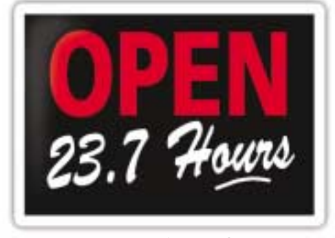
Your uptime: 99%