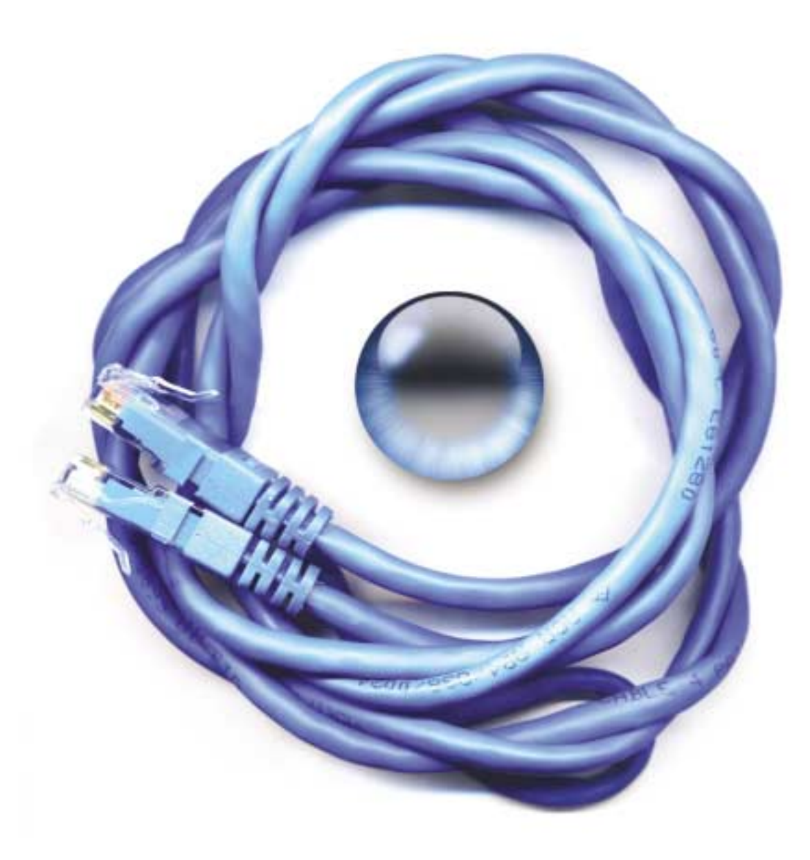
...it pays to check...