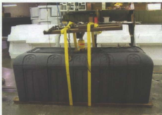
Photo 4: Center Load Pressure Test on Eonian Burial Vault (Full Size) – At approx. 13 kips