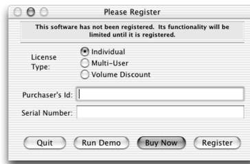
Figure 1: Registration Dialog

Quit – to quit the program, click the “Quit” button