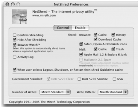
Figure 4: Preferences for running NetShred X automatically