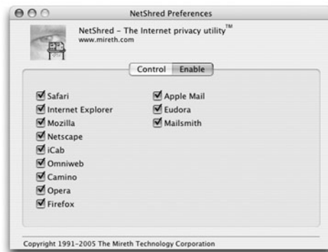
Figure 5: Preferences Enable Tab