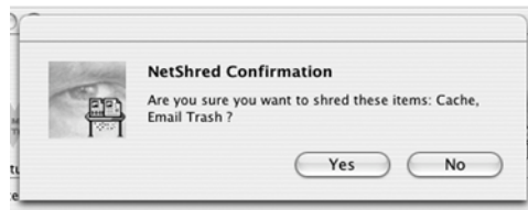
Figure 2: NetShred X Confirmation Dialog