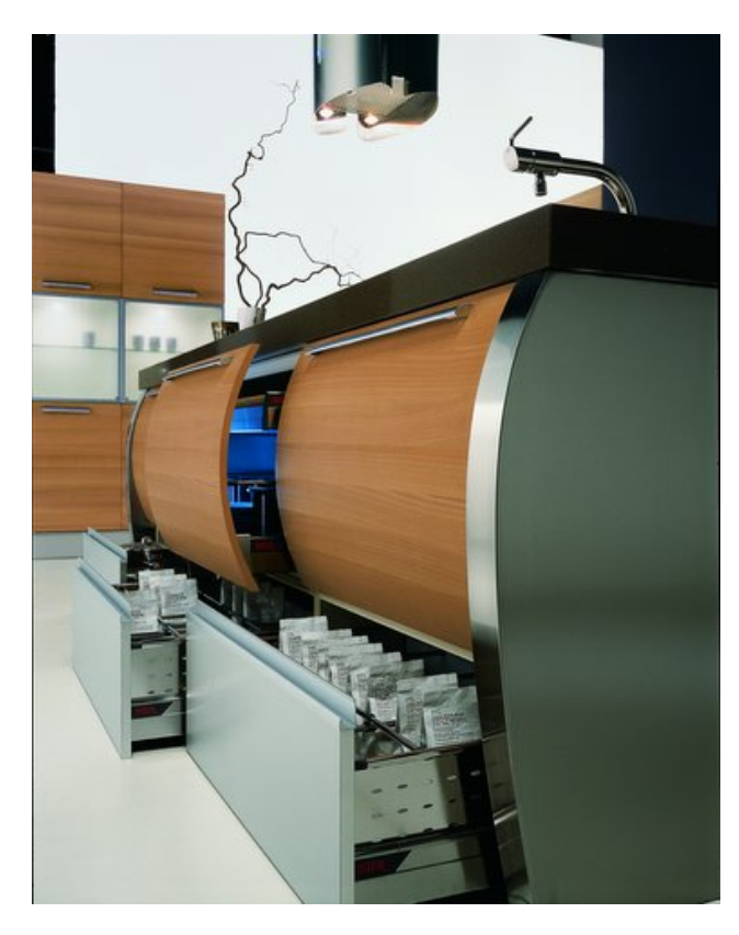
alnut-wood veneered door oak- veneered in eight colors