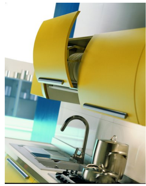
Lacquered door in 45 colors