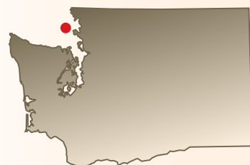
Friday Harbor, Washington Average Weather Statistics