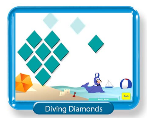
Screen shot from Giggles Computer Funtime For Baby

After 2 years of extensive research and development he became the proud papa of a wonderful new software series for babies' ages 6 to 24 months. In the first title to market, "Shapes," whenever a child touches the keyboard, they are rewarded by fun, on-screen sounds and adorable dancing, flying and spinning shapes. In addition to the 14 activities, each Giggles Computer Funtime For Baby title includes more than 50 songs in 5 musical categories, and Shapes includes a 2nd bonus CD with a limited edition screensaver version of the software.