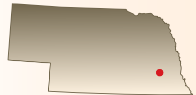
Roca, Nebraska Average Weather Statistics