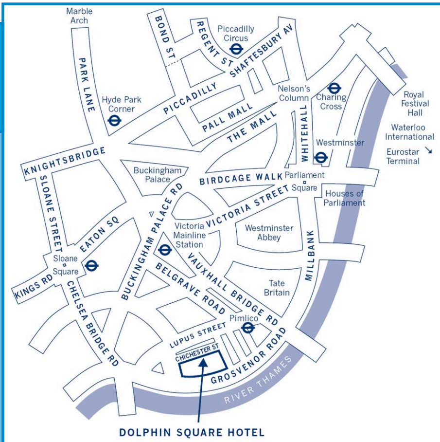
DOLPHIN SQUARE HOTEL