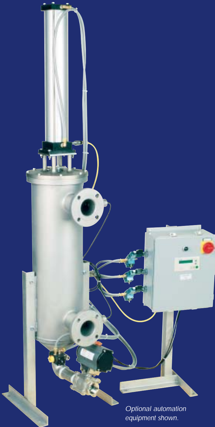
Optional automation equipment shown.