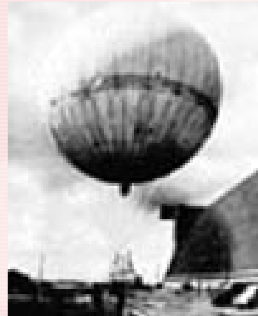
A Japanese Balloon Bomb

It is estimated that nearly 1,000 reached North America.