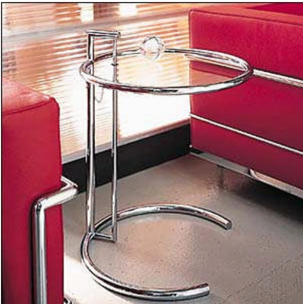
Art Deco Eileen Gray Table

The name Art Deco derived from the Exposition Internationale des Arts Décoratifs et Industriels Modernes, a World's Fair held in Paris, France in 1925.