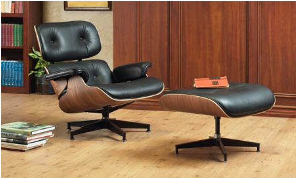
Original Herman Miller Eames Lounge Chair & Ottoman

Mid Century Eames Lounge Chair & Ottoman from Gibraltar furniture.