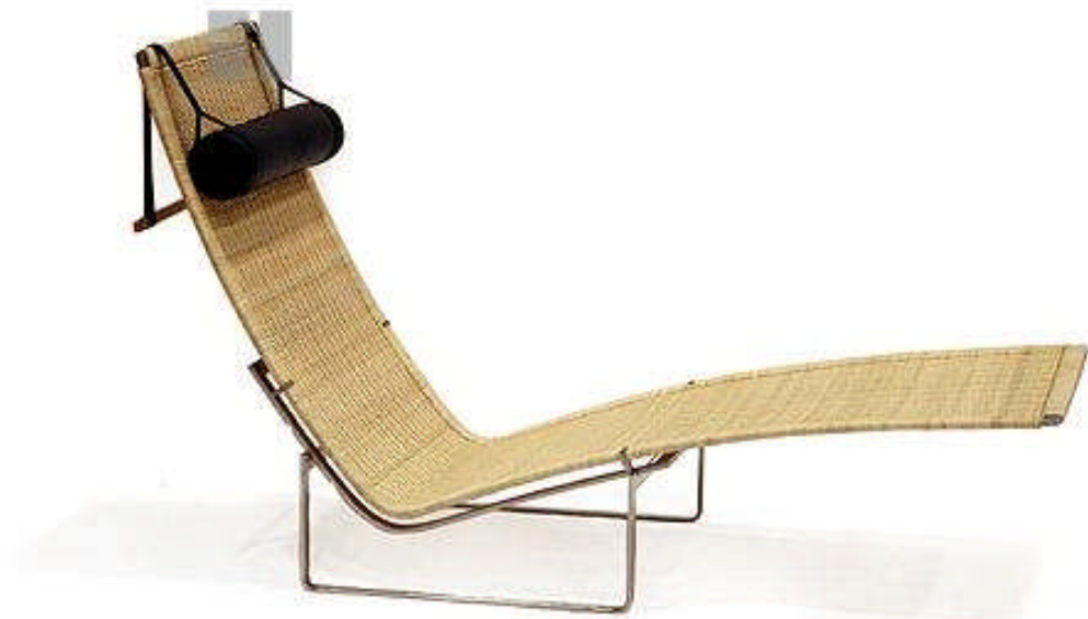
Fritz Hansen Poul Kjærholm PK24 Chaise Lounge sells for 10,858