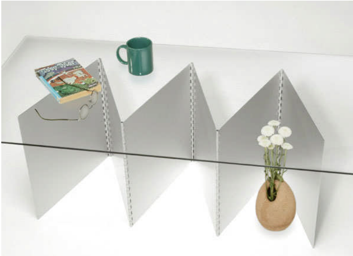
"Orbit Table" Retro look from Jet Age via Gibraltar Furniture.