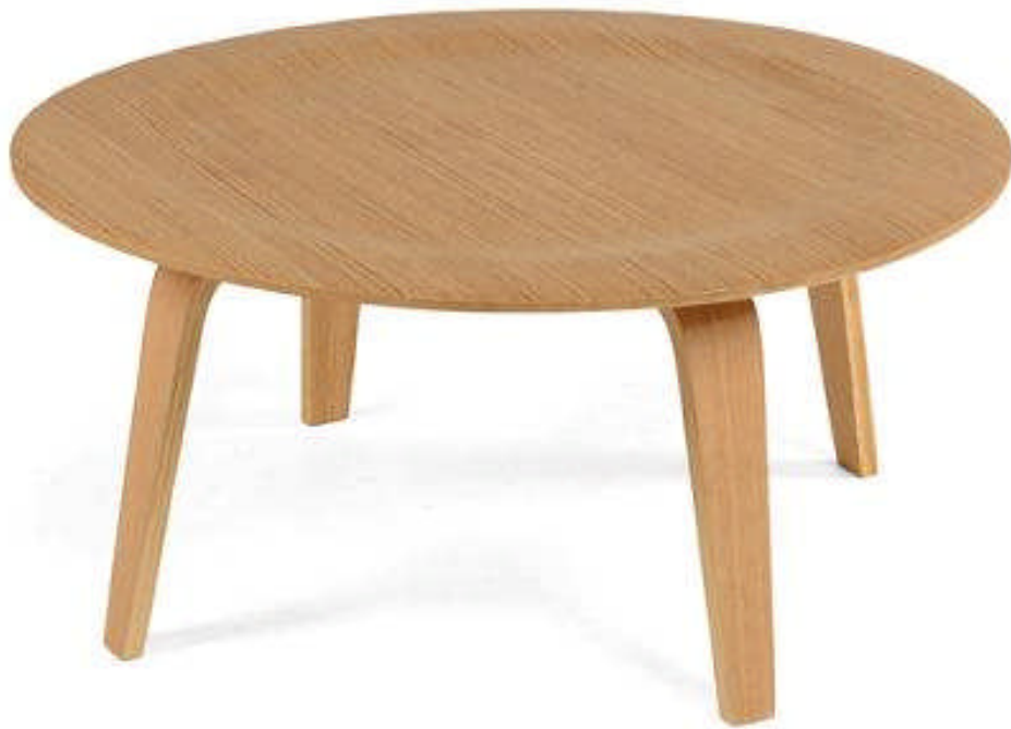
"Noguchi Table from Gibraltar Furniture"

Gibraltar sells the Noguchi style table for only $545. Plan on spending $1195 for a similar table at DWR.