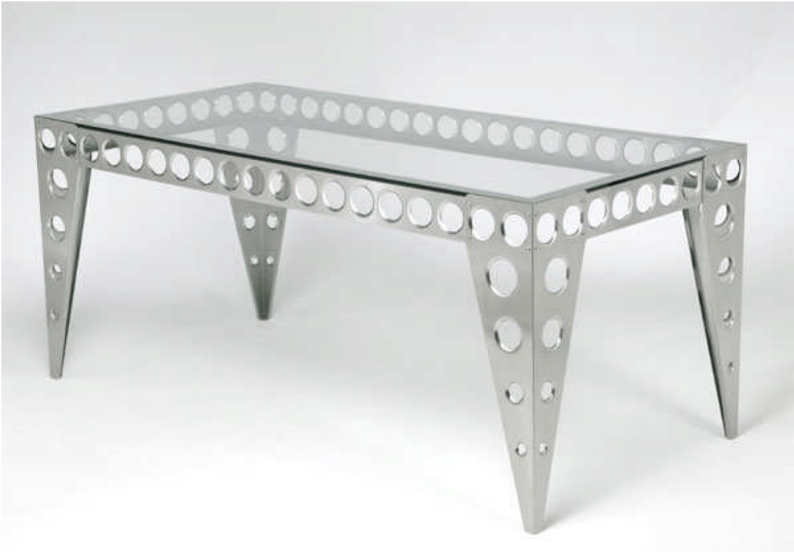
"Jet Age Table"

New mid century table featured at Gibraltar Furniture