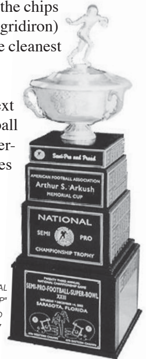
27th ANNUAL "ARKUSH MEMORIAL CUP" NATIONAL CHAMPIONSHIP TEAM TO BE ANNOUNCED IN JANUARY '07