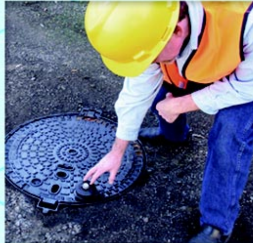
Easy to use!