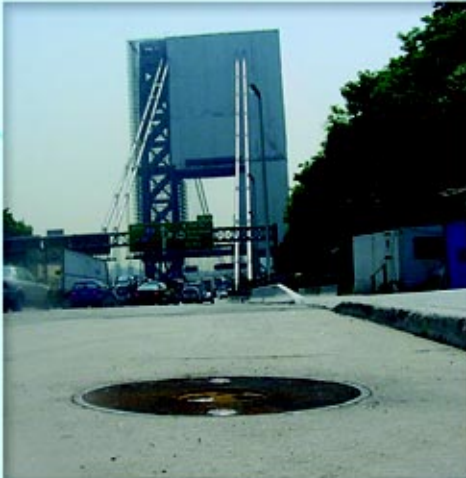
Port Authority of New York and New Jersey (PANYNJ)