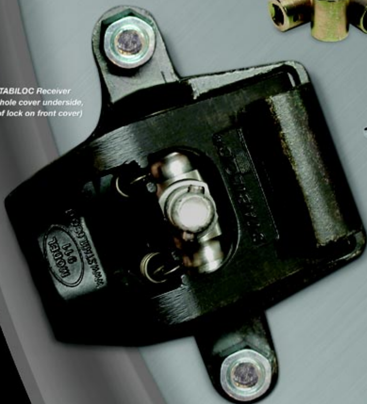
STABILOC Receiver (manhole cover underside, top of lock on front cover)

The patented STABILOC socket matches the exclusive bolt head design and uses a standard 1/2 inch drive.