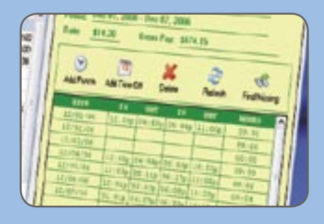
Editina Edit time cards with the Express software