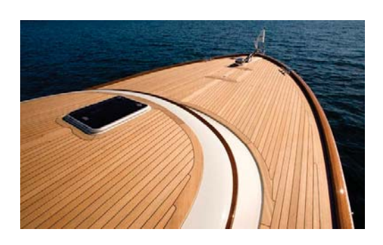
The natural beauty of Teak

While UV absorbing is the most important part from the technical point of view, Teak Guard ® Marine is able to offers many more benefits: