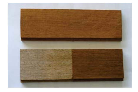
Top piece shows new untreated Teak Second piece was half treated with Teak Guard marine, and was exposed to 6 month weathering.