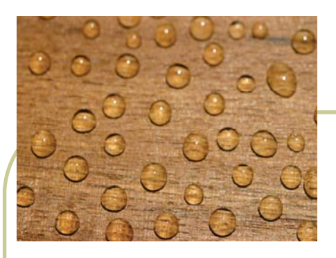
UV protection and Water repellent