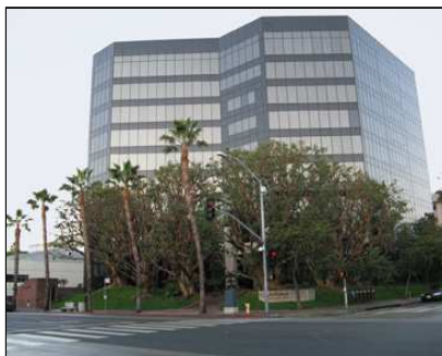
233 Wilshire Boulevard, Suite 200 Santa Monica, CA 90401