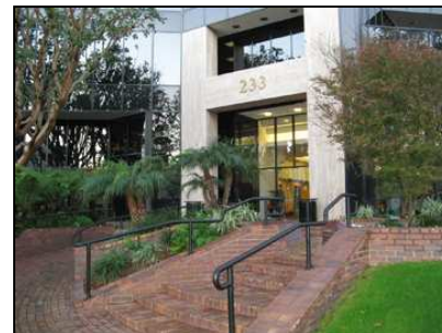
Tel: 310-451-9596 Fax: 310-393-2471 Email: info@procon.org