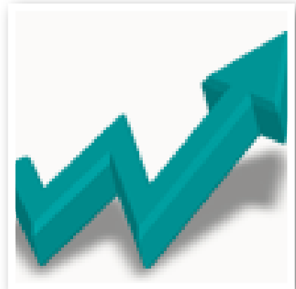
WEB ANALYTICS PROFESSIONAL