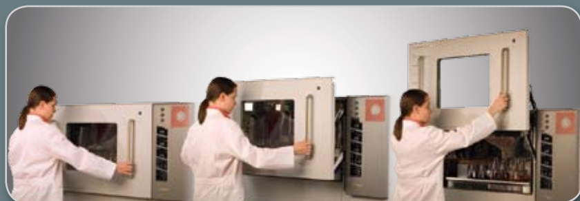
SI9 Door is Equipped with Hydraulic Pistons for Easy Lifting