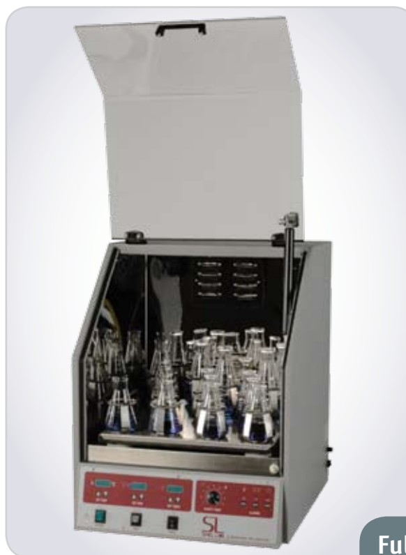
Bench Top SI4

All models use four load bearing delron supports at each corner to reduce the stress on the drive shaft.