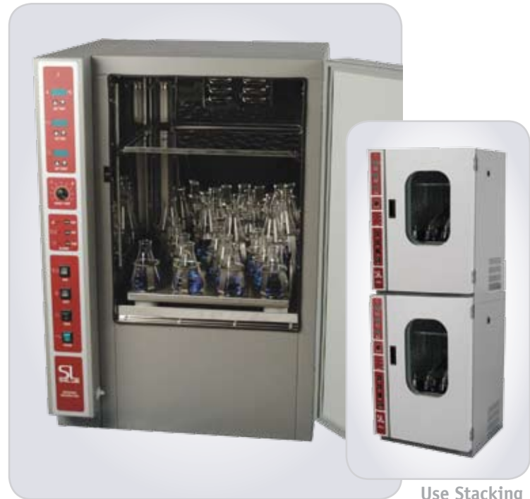
SI6 | SI6R | SI6R-HS