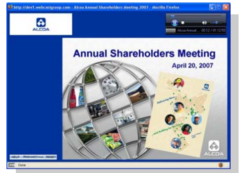
Custom branding is included for free!

Studies have proven that the viewer experience is the most important aspect of a webcast. We deliver the highest degree of viewer compatibility, the easiest viewer access and the highest degree of reliability.