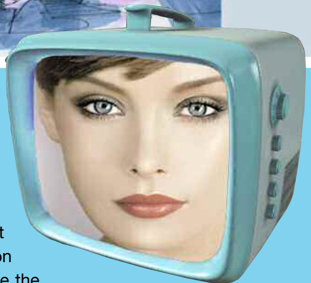
> flying tv, artist impression

At present we are developing a Flying TV, that will hit the sky mid 2005. This hot new media tool will be able to show any type of video footage e.g. a television spot free flying without any attached cables.