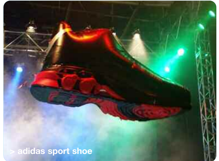
> adidas sport shoe