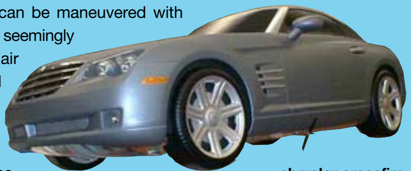
> chrysler crossfire

To date, leading blue chip companies like BMW, Ford, Audi, Samsung, LG, Mercedes, Chrysler and VW to name but a few have utilized this amazing technology with incredible results.