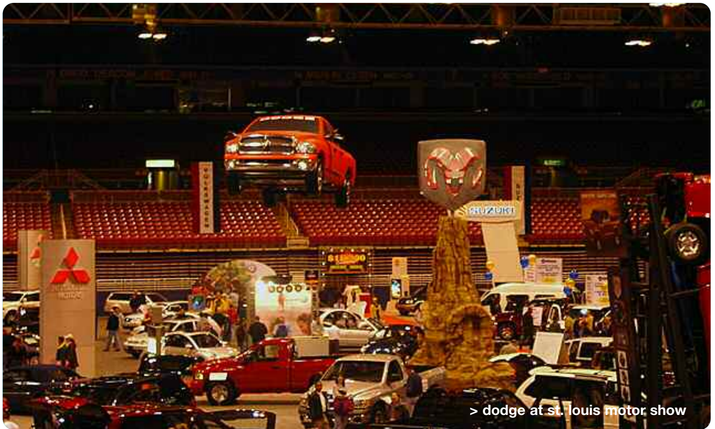
> dodge at st. louis motor show