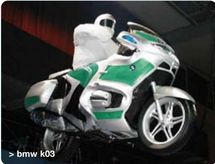
> bmw k03