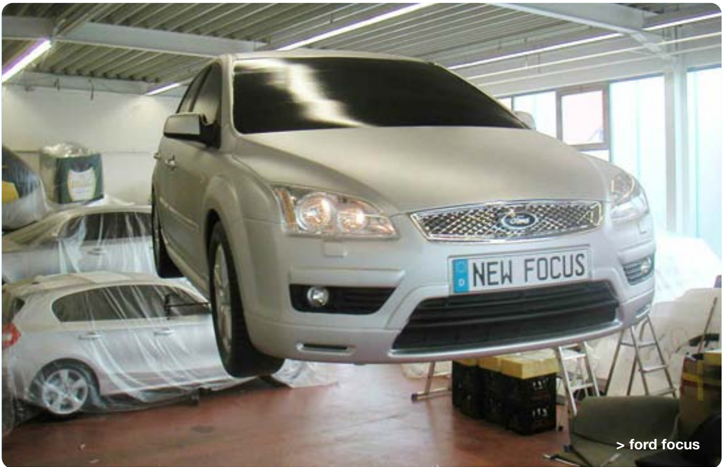
> ford focus