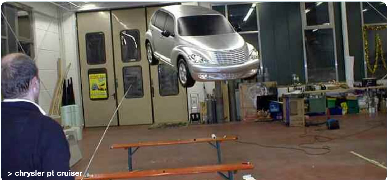
> chrysler pt cruiser