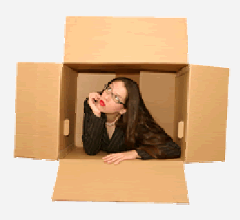
100% Out Of The Box Fast & Easy Deployment