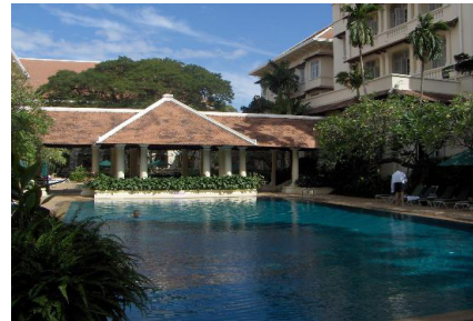
Overnight at the Le Royal Hotel, Personality Suite