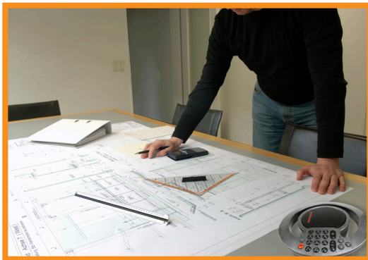
Volume & clarity for your office conference calls