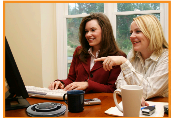
Big office sound at a small office price