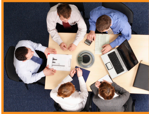
Crisp and clear so everyone can be heard