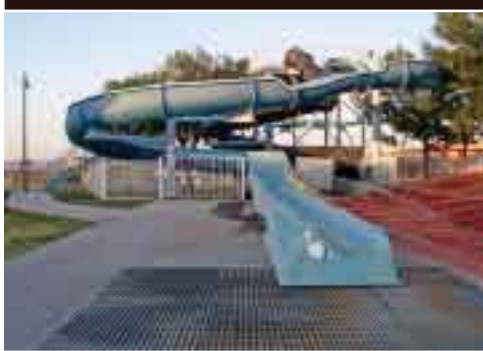
Walnut Canyon Inn/63 Room Hotel- New Mexico's ONLY water park resort!