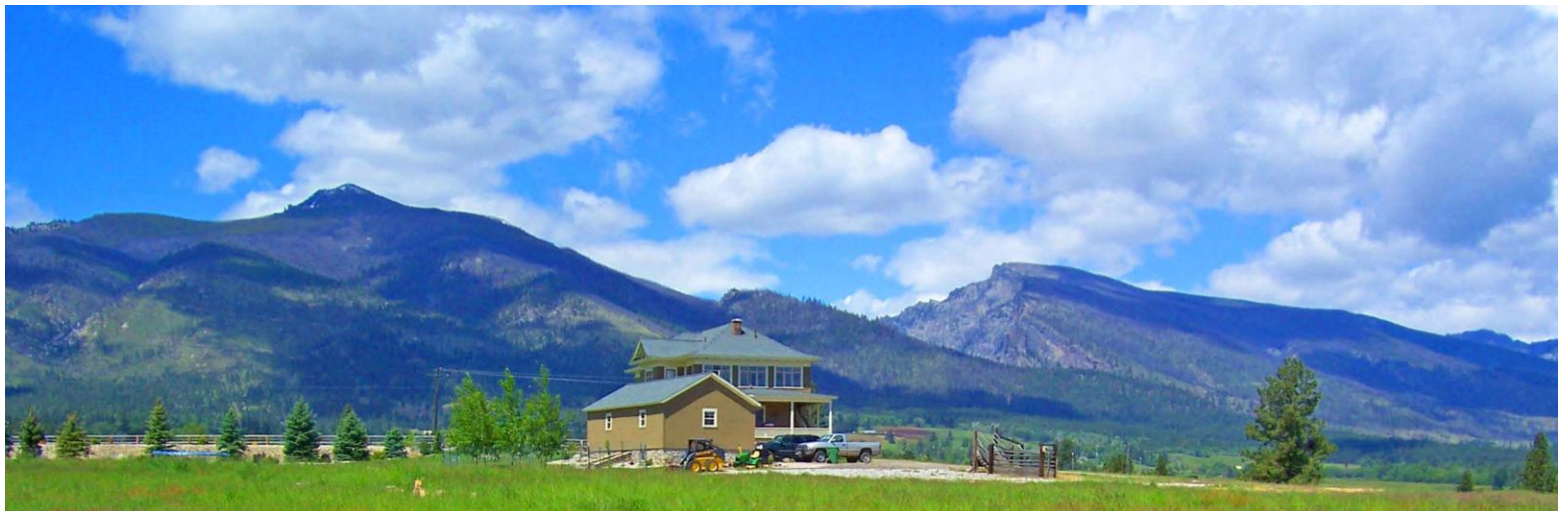
Home with Bitterroot Mountains in Background

The property comes with a second building that has been upgraded with a new roof, siding, drywall, electricity and a reinforced floor. This building could be easily converted into a guest home, office or large work space.