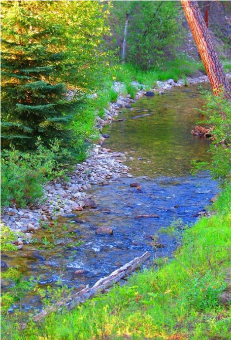
Private Stream on Property

This spectacular Western Montana property sits at the base of the Bitterroot Mountains with commanding views of the Bitterroot valley and surrounding mountains