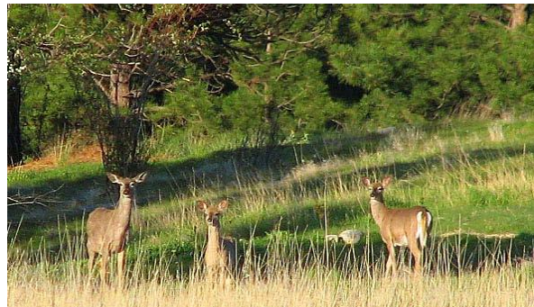
Deer on Property