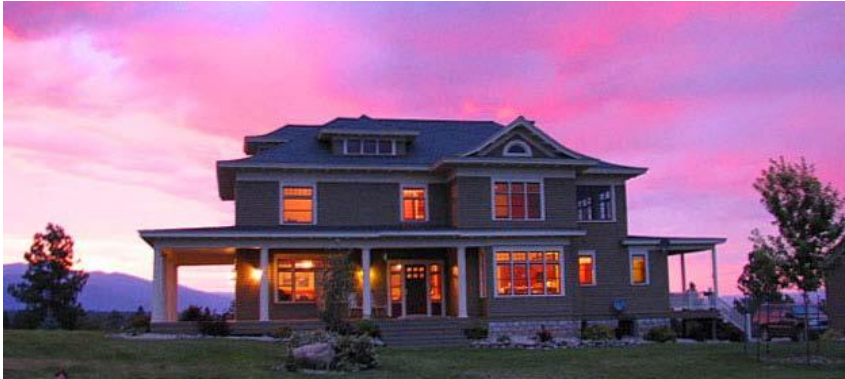
Craftsman Style Home

The original Craftsman style home was completely updated and restored. During the $350,000 restoration, the original wood floors, windows, doors and wood trim were meticulously restored to their original grandeur.