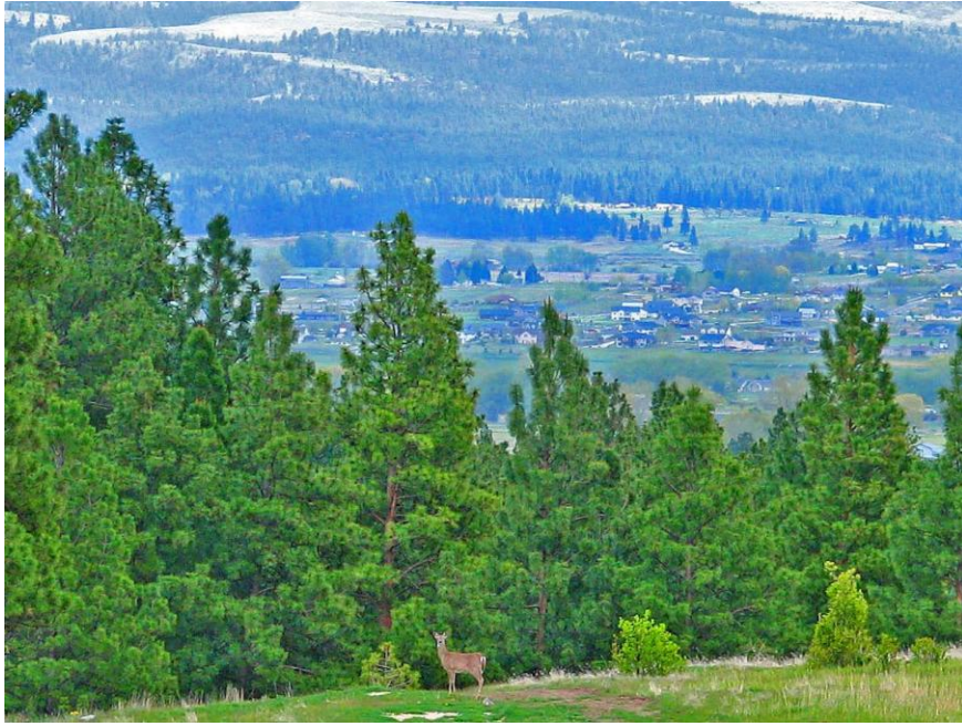
Deer on Property

A west facing second floor enclosed porch provides breathtaking views of the sunrise coming up over the Sapphire Mountains and the Bitterroot valley below.