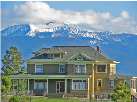
Craftsman Style Home

Valuable water rights, fenced, productive, lush irrigated hay meadows make this the perfect recreational ranch, horse property, or authentic Montana home.