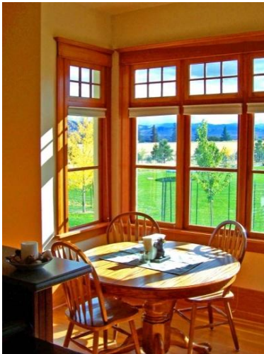
Craftsman Style Windows

Energy saving measures such as batting and blown insulation, Rinnai on demand water heaters and Levelor window treatments were added.