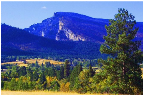
View of Bitterroot Mountains from the property

The chance to own such a highly desirable 40 scenic acres in the mountain setting of Western Montana with an original restored Craftsman home and your own private fishing stream close to Hamilton and Missoula comes along only once in a lifetime.