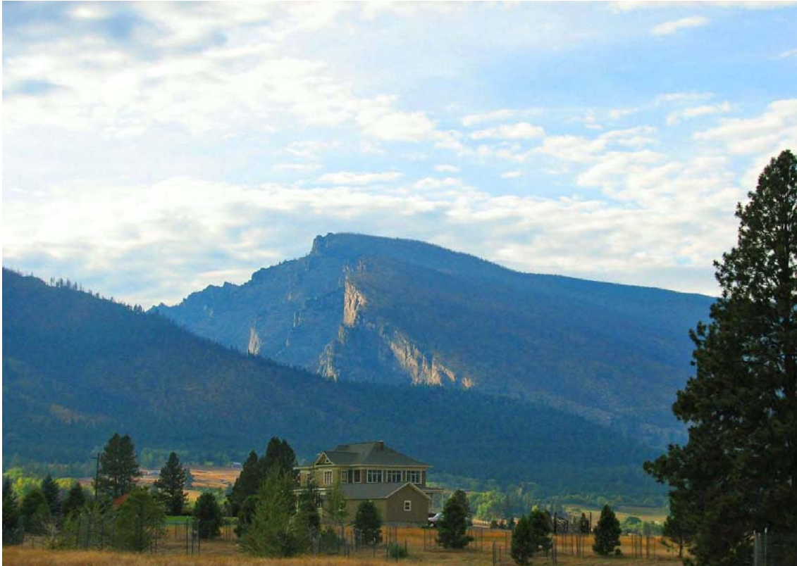
View of Mill Creek Canyon with Home in Foreground