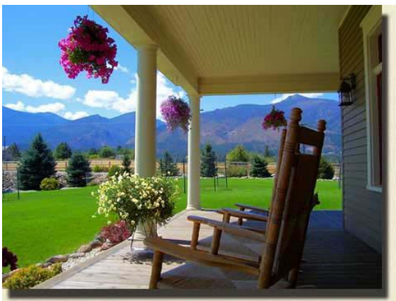
Views of Bitterroot Mtns. from Porch

A spacious, sunny kitchen with Corian countertops, cherry cabinets, and new appliances was created complete with scenic mountain views looking out of an enormous bay window.