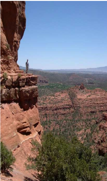
View from Cathedral Rock, Sedona