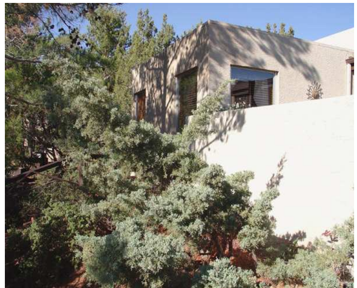
Casita Colibrí, an ecoLuxury Lodging property.

USA TODAY named Sedona "The Most Beautiful Place in America" for many reasons: the ideal temperatures of northern Arizona, the stunning beauty, and being a hikers' and honeymooners' paradise—to name a few. Casita Colibrí is an easy way to spend smart and live rich while you find your own reasons to love Sedona.