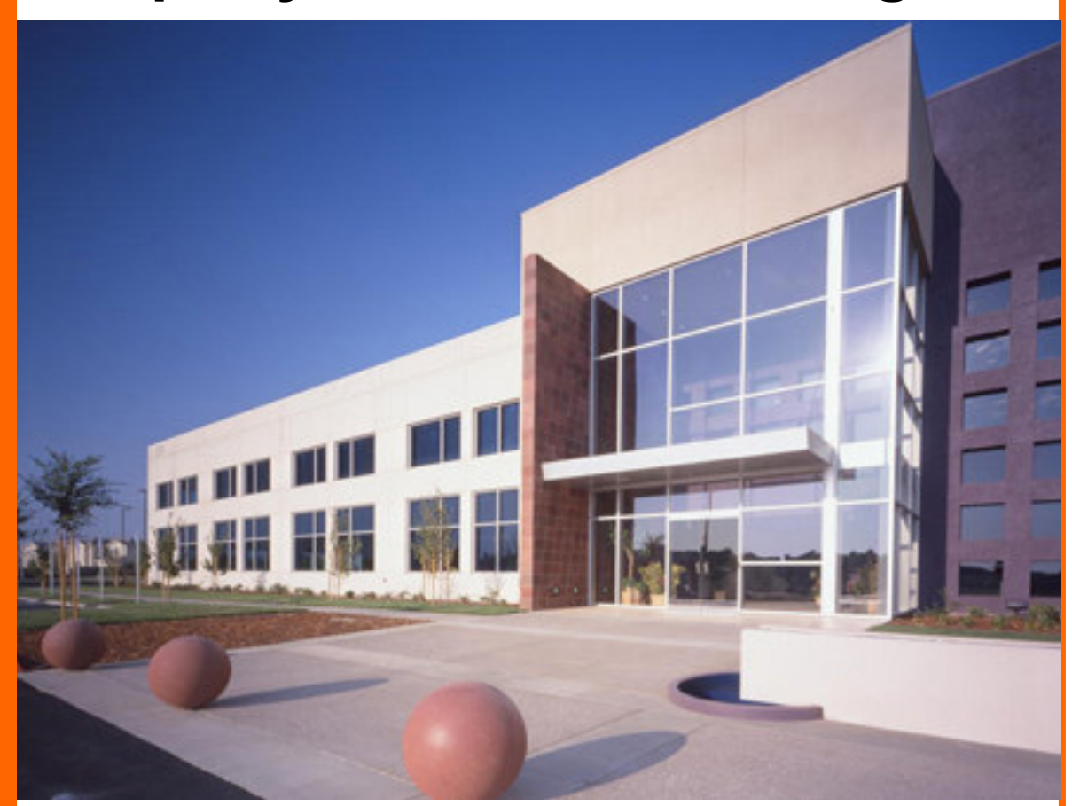
Sacramento, California (USA)

PatentCafe® Certification Training Programs for IP Professionals Advanced Classroom Study in Patent Search and Portfolio Management Solutions