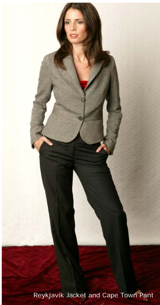
Reykjavik Jacket and Cape Town Pant

The brand's name , " Moi-Même " translates as "myself" from French and is evocative of the very personal and individualized nature of the customer experience and product.