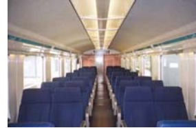
2 nd (Std)

A first class train can carry around 420 passengers (less if onboard fine dining is required), whereas a standard class train can accommodate up to approximately 680 passengers. A mixed class train's capacity lies between these two maxima, depending on the mix of carriages. Luxury trains generally have a capacity of between 100 – 300.