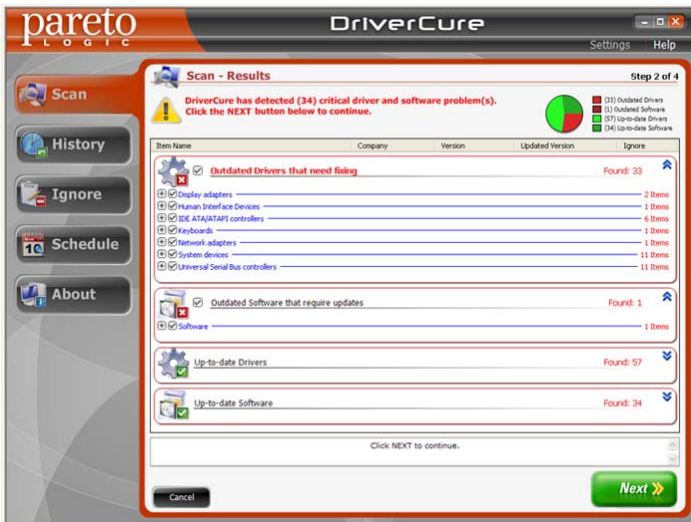
DriverCure – Detailed scanning results show you which drivers you need

Fix and Update Drivers and Software Instantly!