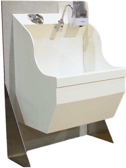
Corian® Scrub Sinks

The Midbrook Corian® Scrub Sink is ergonomically designed to make the sterile scrub process easy, consistent, and hands-free. Midbrook Scrub Sinks feature touchless soap dispensers, temperature gauges, and advanced motion detecting faucets. Our Corian work surfaces can seamlessly integrate into your work environment. Use Corian® to give your designers the opportunity to improve your work environment and reduce your stress.