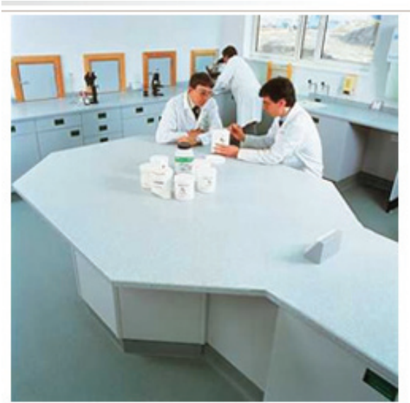
Corian® Work Stations