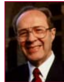
Honorable William J. Perry Former Secretary of Defense Invited to present the 13th Annual William J. Perry Award