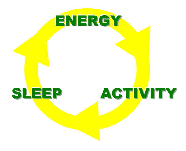
Wheel of Vibrancy

All three elements working together help you maximize a healthy lifestyle – energy begets activity begets sleep begets energy and so on. Once you commit to exercising with your newfound energy, your body needs rest to recover and get stronger. It doesn't get more basic than this.