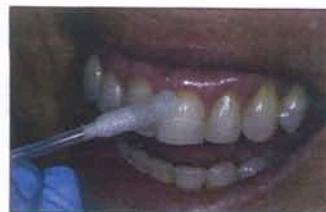
Figure 7. Applying a prewhitener with a soaked swab (Power Swabs [Power Swabs Corporation]).

To solve the dehydration problem, we use a prewhitener (Power Swabs [Power Swabs Corporation; also distributed under Power Start]) that performs 3 functions. First, Power Swabs include solvents that help clean the teeth (like prewash stain removers help in cleaning grass