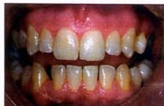
Figure 8. Before whitening.