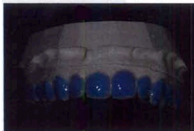
Figure 3. Tray on model.