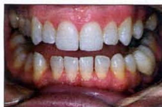
Figure 9. After whitening.

stains off trousers). It doesn't take a rocket scientist to realize that clean teeth should get whiter faster than dirty teeth. Second, since there is less debris on the enamel, the bleaching can penetrate deeper—again resulting in faster and greater whitening. Third (and most important), the swabs contain a surfactant (wetting agent). The surfactant allows the bleaching gel to dissipate all over the teeth keeping them hydrated, and since the teeth are not allowed to dehydrate (keep bleaching times short) the teeth do not get sensitive. Thus, the simple use of this prewhitener produces results that are whiter and faster while eliminating a main cause of sensitivity.