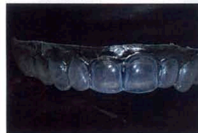
Figure 4. Reservoir tray showing gingival extension. Trays like these hold the bleaching gel intimately against the entire buccal surface of the teeth, but because the margin of the tray is extended on to the gingiva, there is no leakage at the gingival margin.