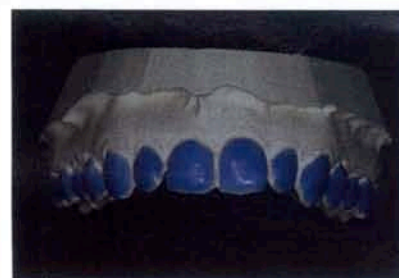
Figure 2. Block out added.