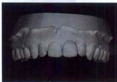
Figure 1. Upper model.

First, make what you are doing important. Take pre-op photos, and plan on midway and post-op photos. Take a pre-op shade. Establish realistic expectations. Then quote a longer treatment time frame. In my office we say, "The average treatment time is about 2 to 3 weeks for the upper teeth, and another 2 to 3 weeks for the lowers, but it's possible yours could take a little longer." Set your fee so you don't have to increase it if you need a little extra time or some extra materials. Then you