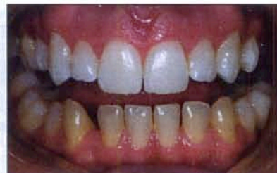
Figure 5. Midbleaching documentation photo. Upper teeth have been completed; the lower teeth are yet to be done.