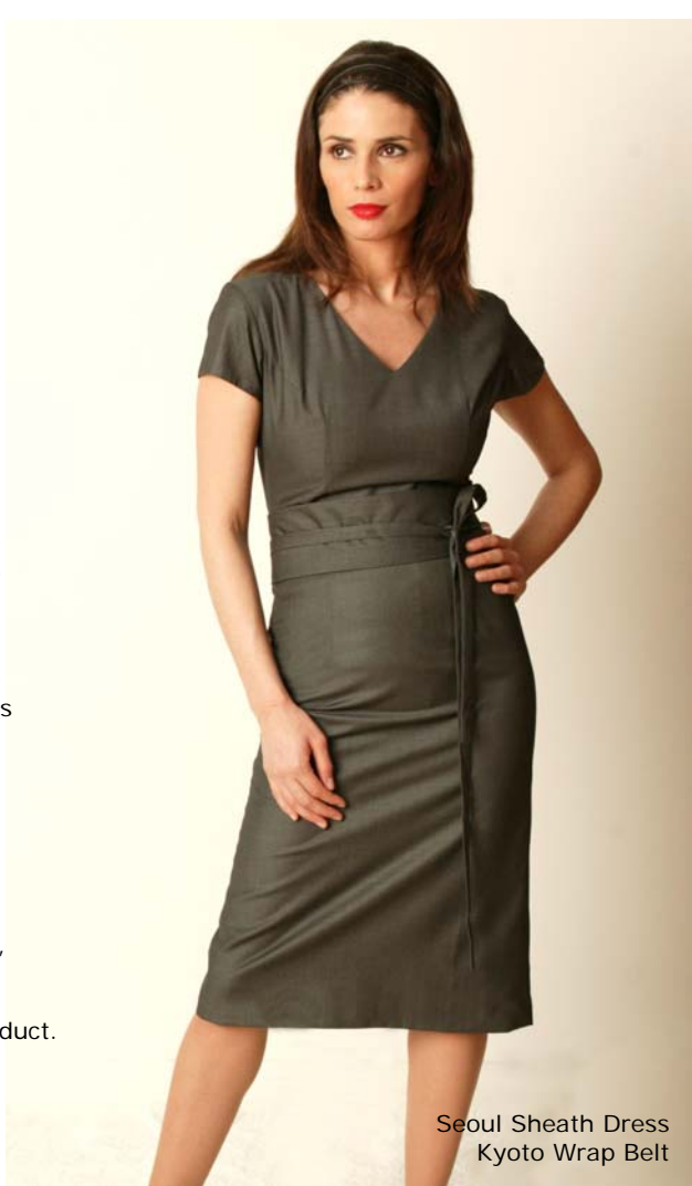
Seoul Sheath Dress Kyoto Wrap Belt

The brand’s name, “ Moi-Même ” translates as “myself” from French and is evocative of the very personal and individualized nature of the customer experience and product.