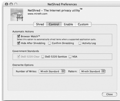
Figure 5: Preferences for running NetShred X automatically