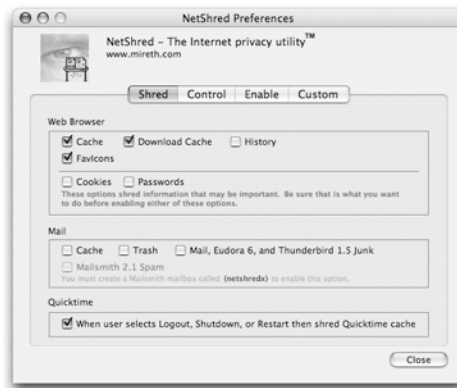
Figure 4: Preferences for selecting NetShred X shredding options

This configuration will run NetShred X automatically in the background.