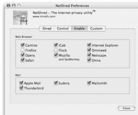
Figure 6: Preferences Enable Tab

Often, customers will enable only a single browser, for example Firefox, and then always use that browser for private browsing. By using Netshred with 2 browsers you can keep history and cookies for your typical browsing and shred them for your private browsing.