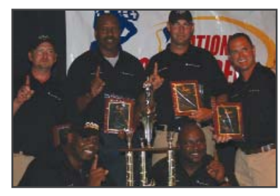
TroubleShooters, Atlanta Gas Light