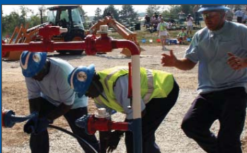
STATION #5 Regulator Bypass

NEW IN 2009 2-person teams will compete in the Regulator Bypass