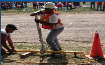
STATION #3 Squeeze Off*