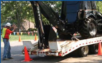
STATION #1 Truck & Trailer Back-up