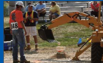
STATION #4 Softball Pick-up