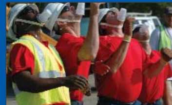
STATION #6 Water Cooler

NEW IN 2009 2-person teams will compete in the Regulator Bypass