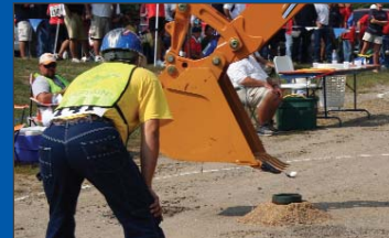
STATION #2 Egg Pick-up