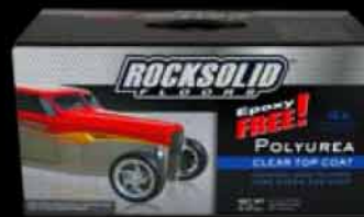
Clear Top Coat

been utilized in industrial such as pipe / and linings, plants, manhole and automotive molded parts. In familiar with truck bed liners,