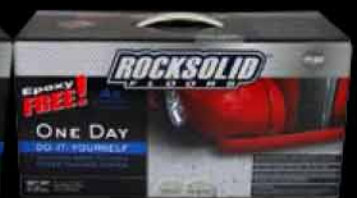
One Coat Polyurea System