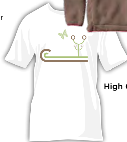
High Quality T-Shirts