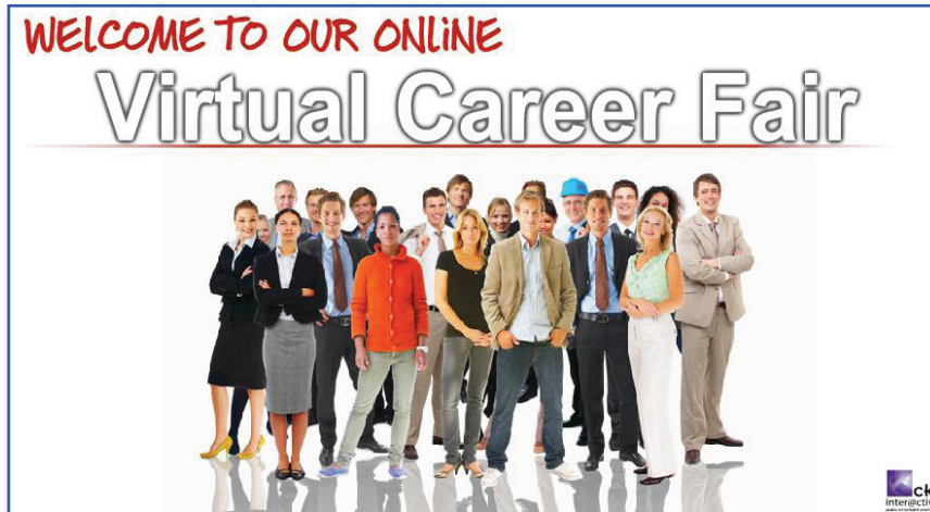
Virtual Career Fair Screen Captures