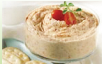
Zesty Pepperoni spread ▶