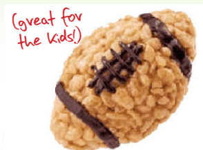
Kellogg's® Rice Krispies Treats® Mini-Footballs ▶