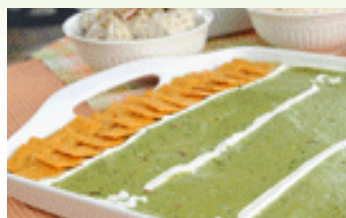
Cheez-It™ Game Day Guacamole ▶

Try your hand at these easy-to-make recipes!