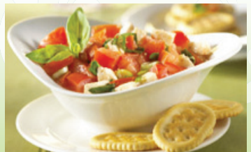
Tomato and Cheese Tailgate Topping ▶